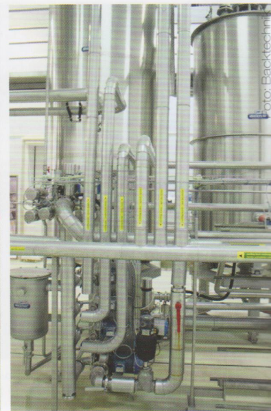
Left photo: The starter dough gets the time to develop in two maturity containers. The big cooled storage tank is on the left. Middle photo: Before the starter dough flows into the storage tank, it is cooled down to 5°C in a plate heat exchanger. Right photo: An extensive cooling system ensures that the individual ingredients are at the desired temperatures.

dough tanks are filled from the bottom up. In this way, the plant builder avoids dough deposits on