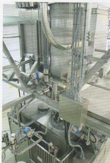
Left photo: While the flour is continuously filled to be mixed in the lower scale, the next batch can be weighed in the upper scale. Right photo: Daxner International has also delivered the plant system for weighing the product above the Turkington kneader.