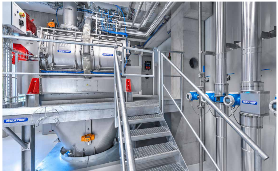
Mixer with mixer tank and liquid dosing

ped with several aspiration systems to minimize dust.