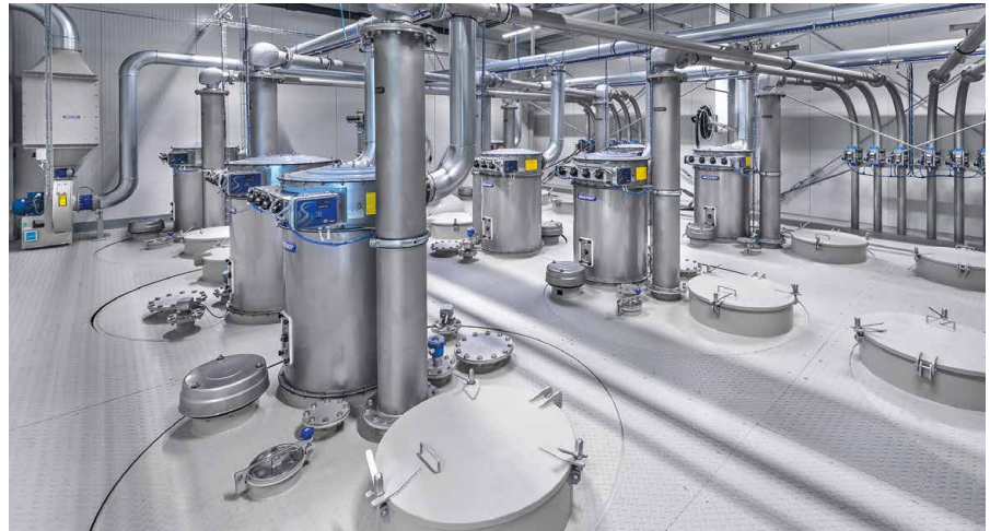
Major silo head space with filter and clean air collecting lines

Medium, small and micro components are stored in day bins of various sizes. Fully automated Forklifts, pallet conveyors and pallet lifts transport the pallets and Big bags from the high bay storage unit to the different stories of the storage silos. The contents of Big bags, bags and containers (premix) are filled into the day bins. Mobile bag, Big bag and container discharge stations dock onto to the respective day silos. Once again, the raw material is control screened to prevent