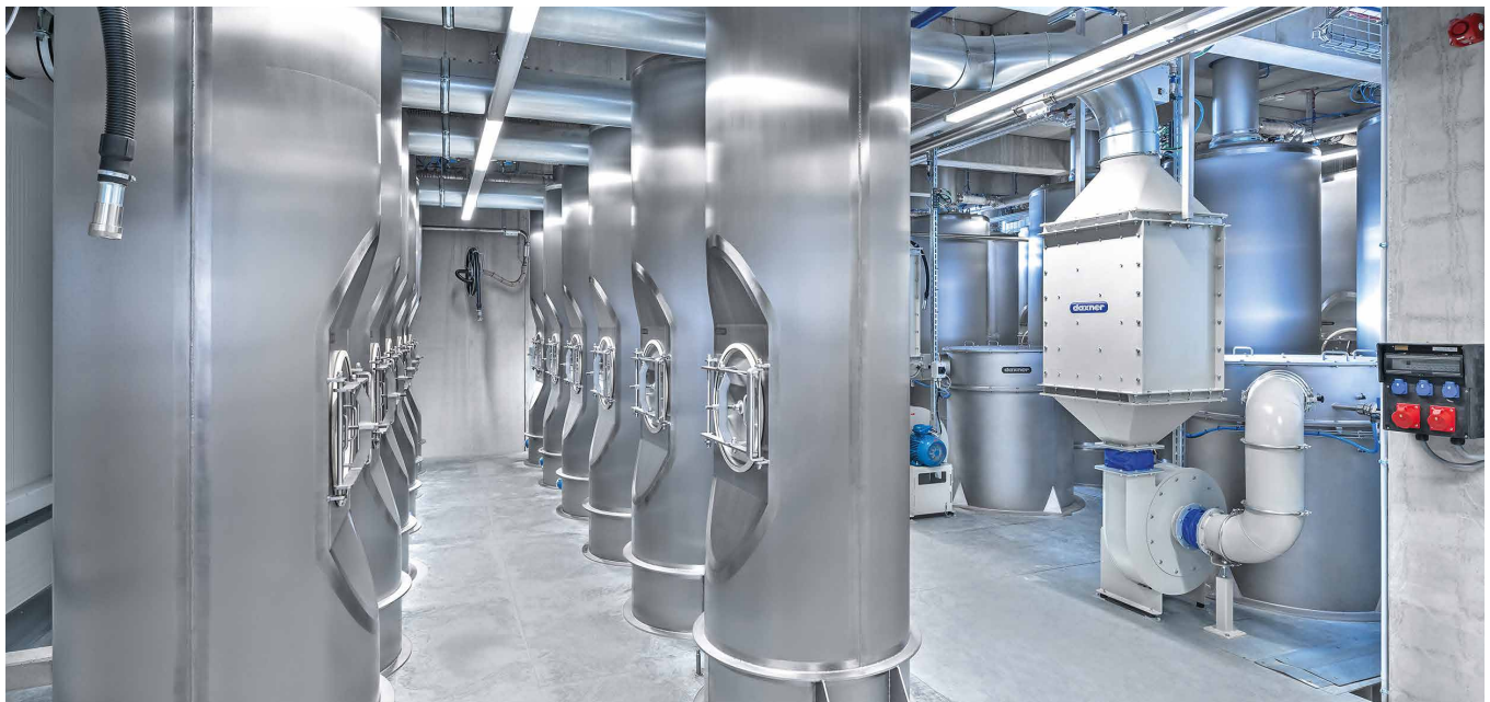
Storage silo for small and medium components

Manual components, which are only required in very small doses, are filled in boxes in a separate commissioning station. These boxes are stored in a shelf system.