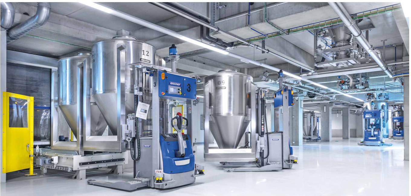
The containers are moved through the production plant using an automated Guided Vehicle system

different floor levels. To transport containers from one level to the next, a container/pallet lift was implemented.