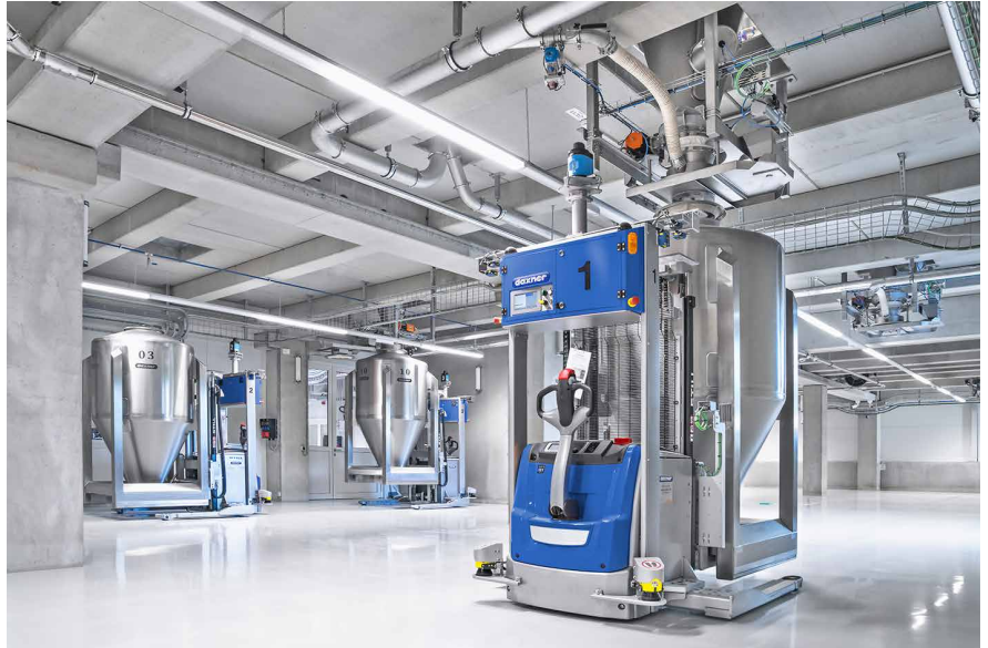
The laser controlled, driverless container system collects the dosed raw materials from the weighing unit and the manual intake station and transport them to the container lift.

The laser controlled, driverless container system collects the dosed raw materials from the weighing unit and the manual intake station and transport them to the container lift. With the help of the container lift and roller conveyor, containers are positioned above the mixer and emptied automatically. On the different levels of the production facility, laser controlled, automated guided vehicles (AGV) harmonize perfectly